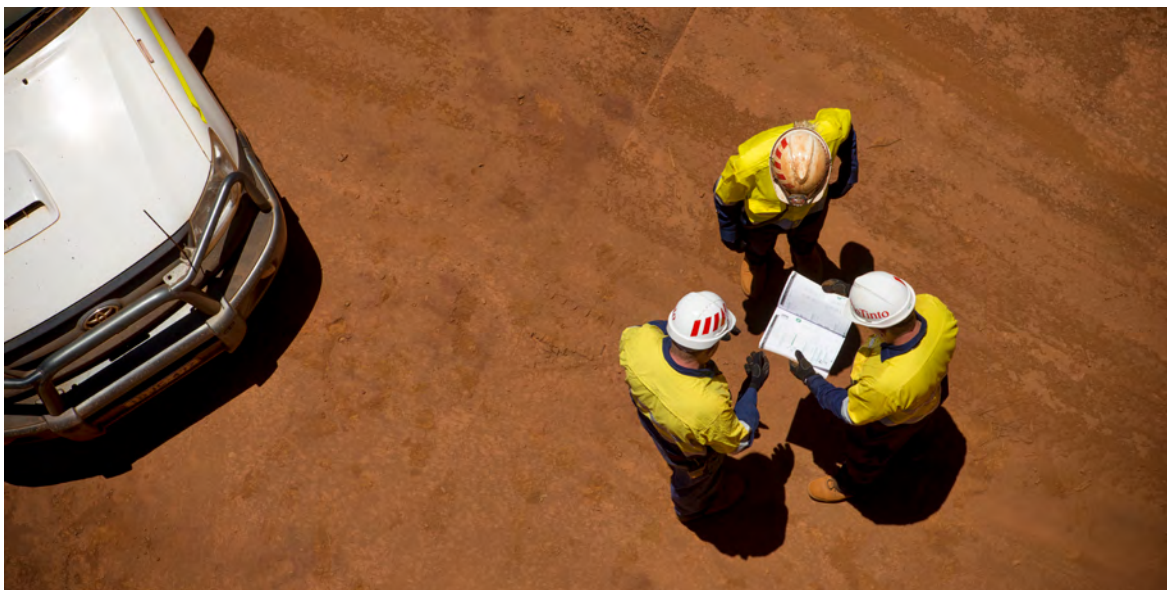
Employees at Dampier Port, Australia, prepare for work.

We recognise the benefits of multi-stakeholder collaboration and participate in a number of initiatives which provide important forums to discuss modern slavery.