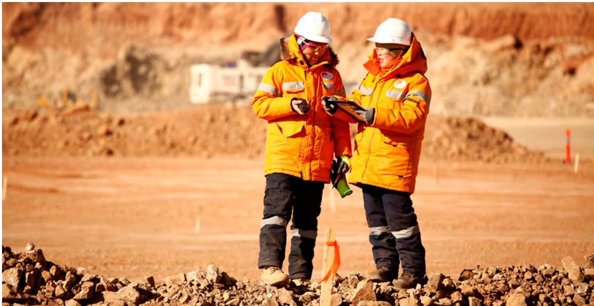
Image above: Employees conduct a safety briefing at the Oyu Tolgoi copper-gold mine, South Gobi desert, Mongolia.

Modern slavery is an emerging global issue that businesses need to be alert to and prepared to address. Rio Tinto expects that our employees and suppliers will reject modern slavery.