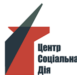
Social Action Centre