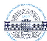
National Technical University "Dniprovskaya Polytechnic"